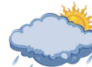
Sun & Rain