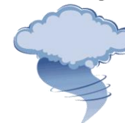
Tornadoes / Hurricanes